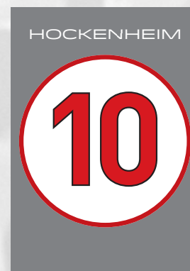
SILVER RED NOSEBAND