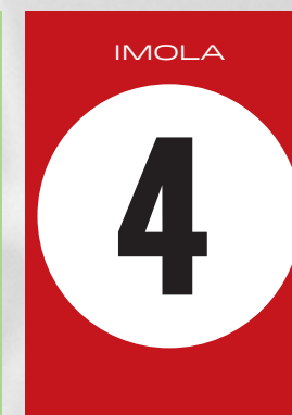
RED WHITE NOSEBAND