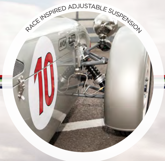
RACE INSPIRED ADJUSTABLE SUSPENSION