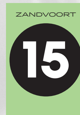
LIGHT GREEN BLACK ROUNDELS