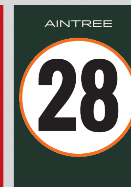
DARK GREEN ORANGE NOSEBAND