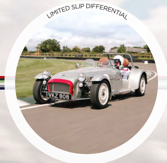
LIMITED SLIP DIFFERENTIAL