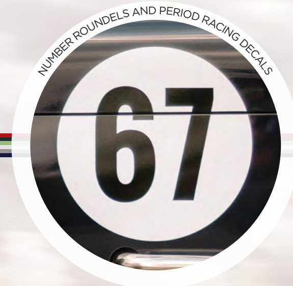
NUMBER ROUNDELS AND PERIOD RACING DECALS