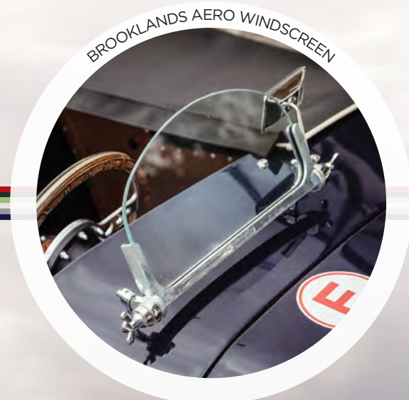
BROOKLANDS AERO WINDSCREEN