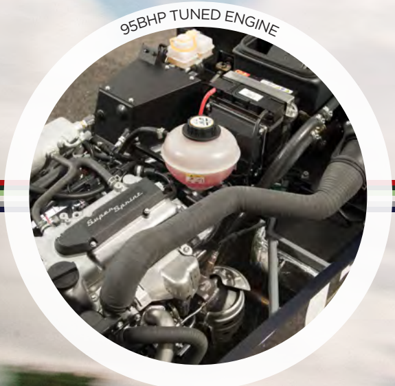
95BHP TUNED ENGINE