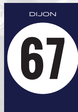
NAVY BLUE WHITE NOSEBAND