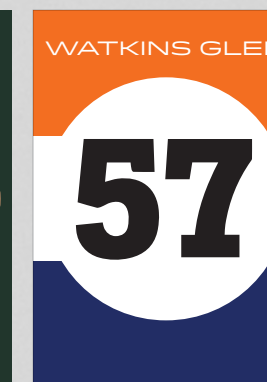
WHITE GULF RACING STRIPES